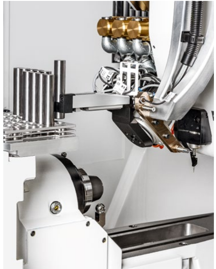
Option: Top loader

Walter Maschinenbau GmbH Jopestr. 5 · 72072 Tübingen, Germany Tel. +49 7071 9393-0 · Fax +49 7071 9393-695 info@walter-machines.com